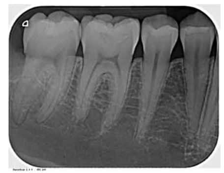
Fig 3: Follow up radiograph dated December 2016, of class 1 GCP Glass Fill restoration 46 placed over deep caries in February 2015.

prepared to be involved in the handling evaluation of a novel glass carbomer restorative material. Of those who agreed to participate, 12 were selected at random.